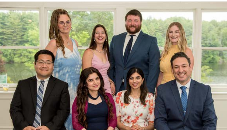
ECHN Residents celebrating their graduation

The future health and wellness of the community relies on tomorrow's medical professionals. ECHN's numerous medical education programs provide a community-focused setting for young physicians and nurses to grow into their roles as eastern Connecticut's future healthcare providers.