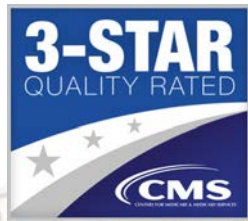
Manchester Memorial Hospital

Manchester Memorial Hospital earned the Healthgrades Award for Patient Safety Excellence in 2022, 2023 and 2024. Manchester Memorial Hospital also received a 3-Star Quality Rating by the Center for Medicare and Medicaid Services.