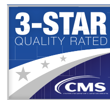
Manchester Memorial Hospital