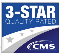
Manchester Memorial Hospital