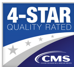
Rockville General Hospital

Manchester Memorial Hospital earned the Healthgrades Award for Patient Safety Excellence in 2023. Manchester Memorial Hospital and Rockville General Hospital each received a 3-Star and 4-Star Quality Rating, respectively, by the Center for Medicare and Medicaid Services.